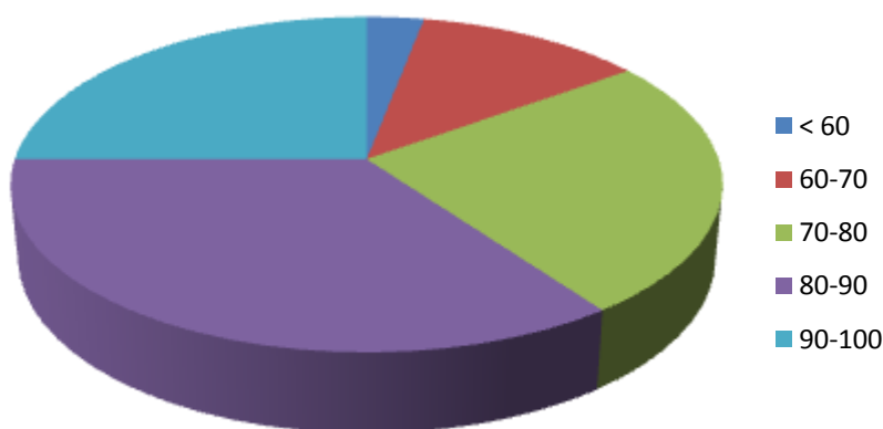
Pie- diagram of the Indices of feedback on teaching